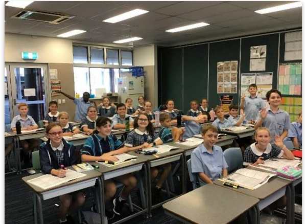
5.2 Matrix class.

Welcome to Term 1, 2020. We hope you had an enjoyable Christmas break. We are looking forward to a productive and exciting year ahead in Area 56. Over the course of this term all of our Year 6 students will be encouraged to embrace and develop their new role as Leaders in the Primary College, irrespective of whether they have an official student leadership position. Some of the exciting events coming up are;